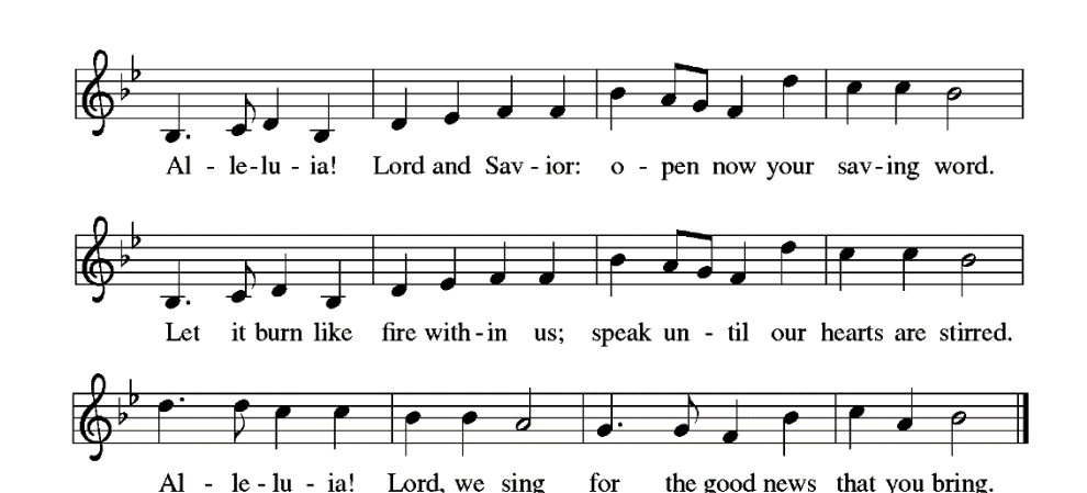
GOSPEL: Luke 10:25-37

The Holy Gospel according to St Luke, the tenth chapter. Glory to you, O Lord.