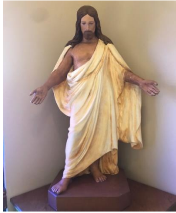
This statue of Jesus was part of an altar purchased by the first Lutheran league in 1908. It was placed in an old shed and found again in 1972, when it was restored and brought to the new church.