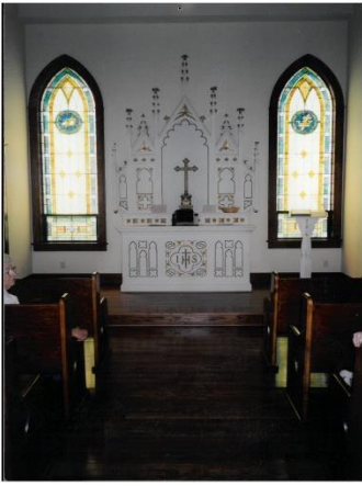
When the two churches merged, the altar from the St John church was eventually placed in the church at the Franklin County Fair grounds.